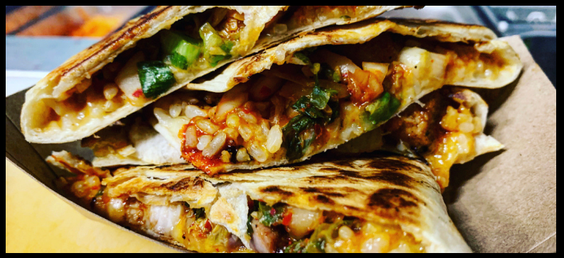
The Kimchi Dilla