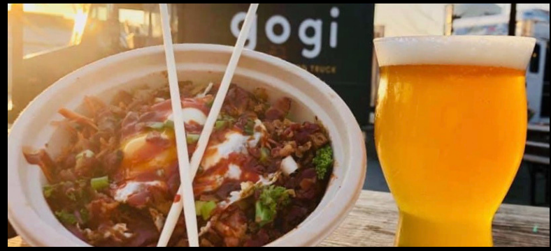
Pork Bibimbap (bowl)