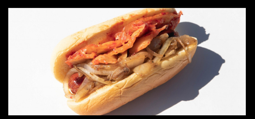
The Kimchi Dog