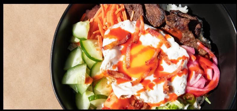
Beef Bibimbap (bowl)