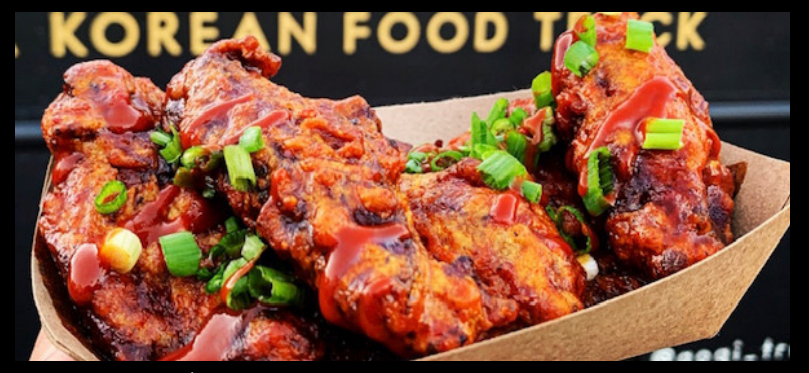
The K-Pop Wings